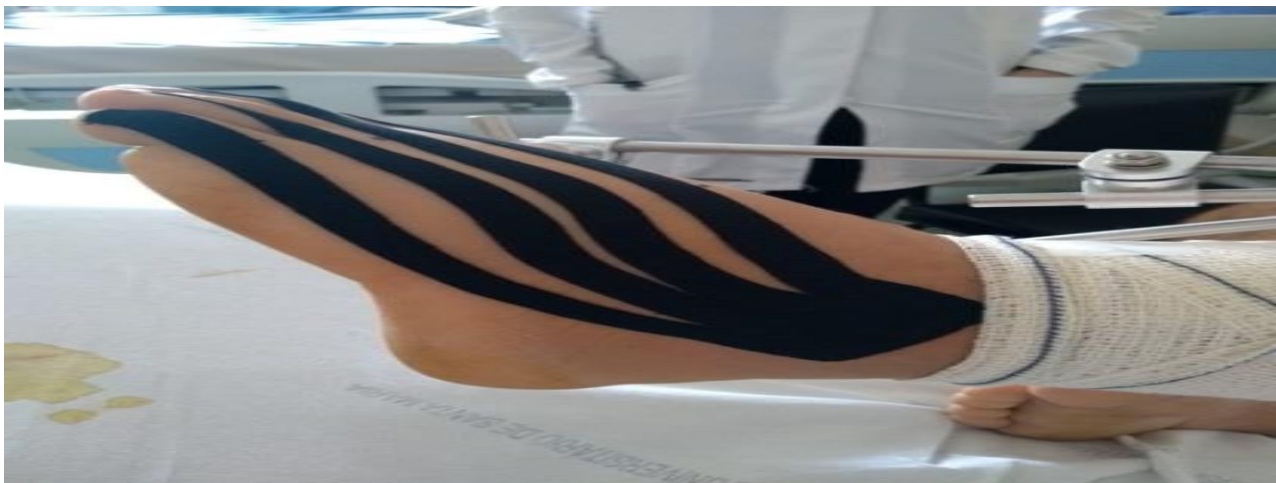
Figure 2. Fan tape on left foot. Santa Maria, 2018.

There were only two applications of the functional bandage in view of discharge and for personal reasons not being able to attend the meetings to continue the treatment of the edema. The tape was applied only to the dorsal region of the foot, due to having the external fixator and bandages, as can be seen in Figure 2. However, he reported that the pain I felt up to the knee region decreased a lot .