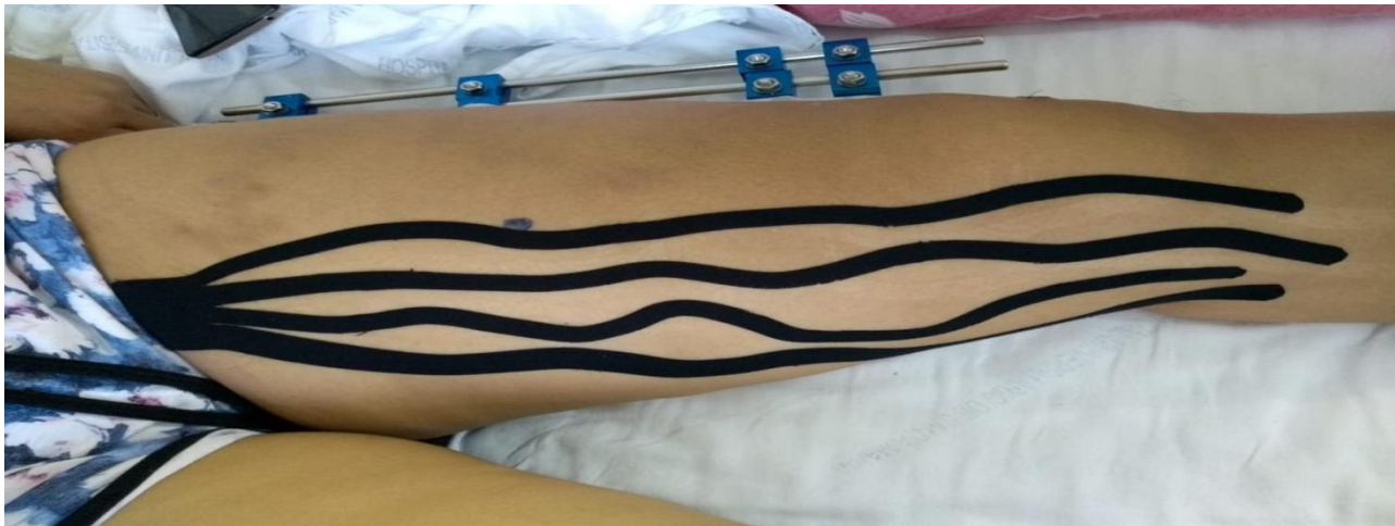
Figure 1: Fan tape on the left lower limb, patient 1. Santa Maria, 2018.

The main occupational deprivation reported was that the edema was limiting knee flexion, influencing several occupational activities such as: walking; getting dressed; performance of personal hygiene; transfer and posture changes.